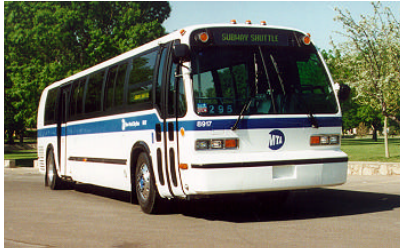
Fig. 3: A Nova Transit bus, similar to the one used in the battery/battery hybrid demonstration

Moreover, a hybrid propulsion system allows the designers to select and specify propulsion system components without compromising or trading-off the inherent attractive properties of each system element, a step usually necessary in arriving at acceptable power/energy ratios in single battery electric vehicles.